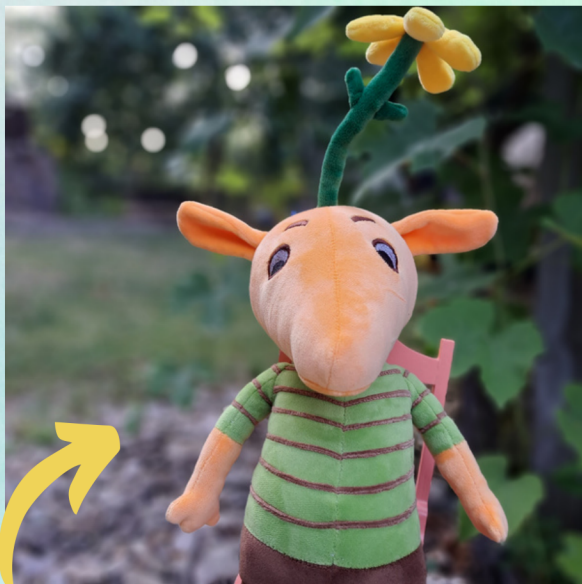
This is Winslow, our mascot.

Grown with love in Harrisonburg, Virginia and Idaho Falls, Idaho